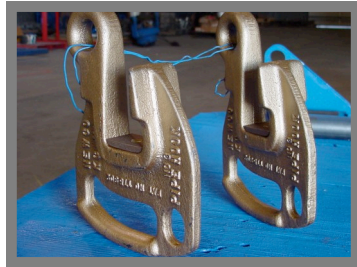
MODEL NO. 3A