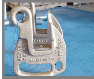
MODEL NO. 3A