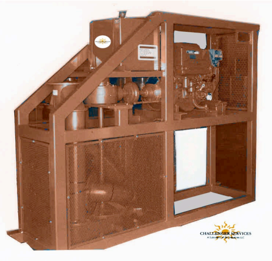
Model DP-6 Ditch Pump-6" (152mm) discharge